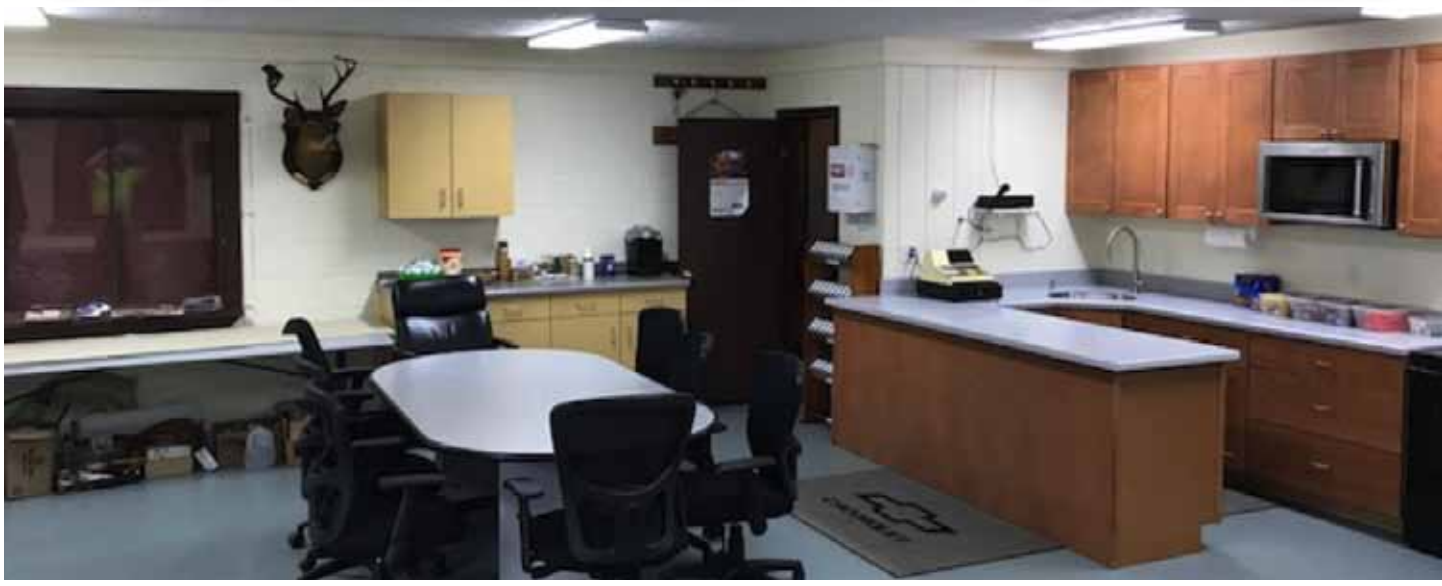
Newly remodeled Shack