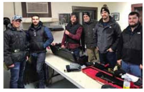
A good time at Skeet Shack

have been slowly making repairs, and hope to have all cleared within the next week. That said, the fields are open and shooters are having fun.