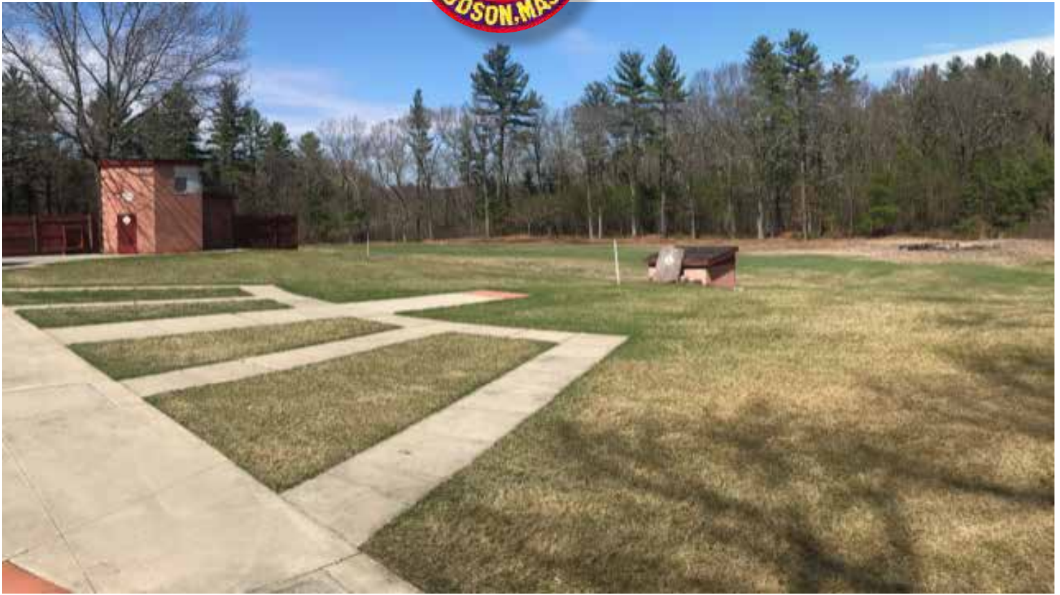
Spring clean-up all finished. Thanks to all who helped.