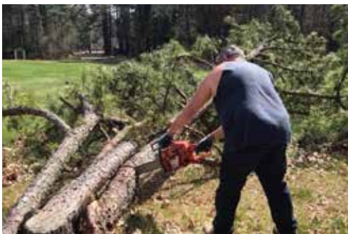
Thank to Jeff Cicoine for cutting up and dragging the downed pine trees to the burn pile.