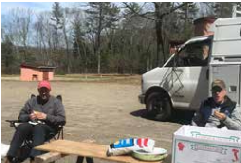
Raking fields work party

The Winter season is hopefully behind us and we were looking forward to green grass and spring shooting. Well, after March 17, we got one out of two. After much discussion and planning, we will be opening the skeet & trap fields on Sunday May 24 with new guidelines.