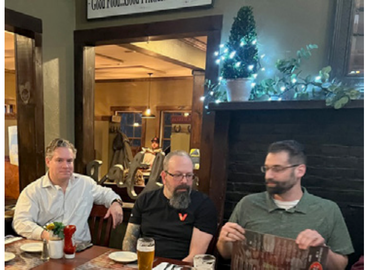
Pistol Team Banquet

Promoting good sportsmanship and conservation practice is our goal. It is important for our families to be able to hand down from one generation to the next the tradition of hunting, fishing or participating in recreational shooting sports.