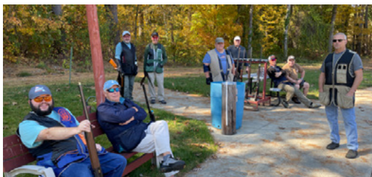
Getting ready to shoot long range trap game