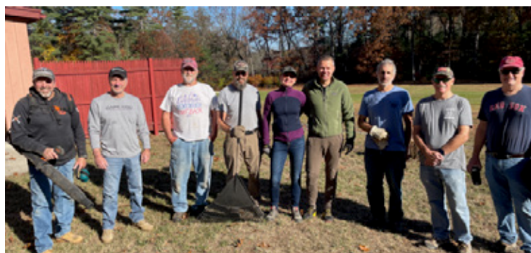
Fall clean up volunteers

We have a new 5-stand configuration for this season, including triples (bring your semi-auto shotguns). Check out our 2025 calendar on club skeet page.