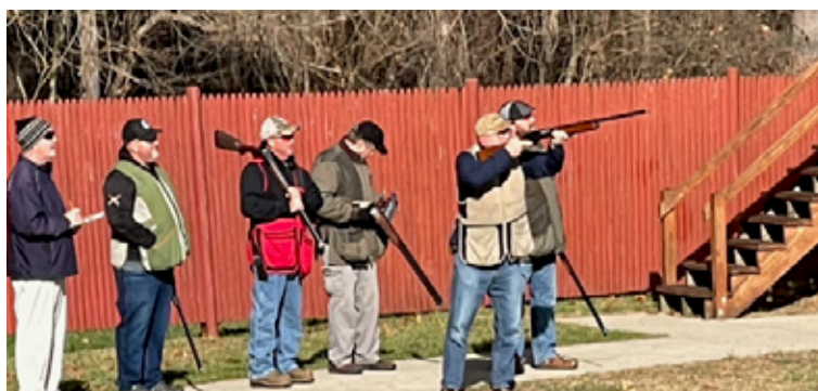
Squad of skeet shooters

We have a new 5-stand configuration for this season, including triples (bring your semi-auto shotguns). Check out our 2025 calendar on club skeet page.