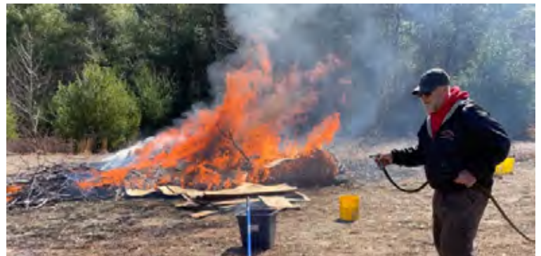
Ken B keeping an eye on spring fire