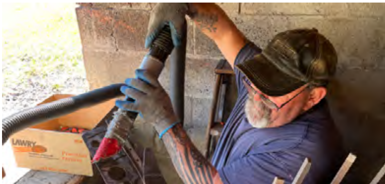
Rick M cleaning another machine

Fall cleanup is scheduled for Saturday November 8th from 9-11AM. We plan to rake fields, load station houses with targets, and do general cleanup, followed by pizza and soft drinks. If you can, please stop by and lend a hand; all help will be much appreciated.