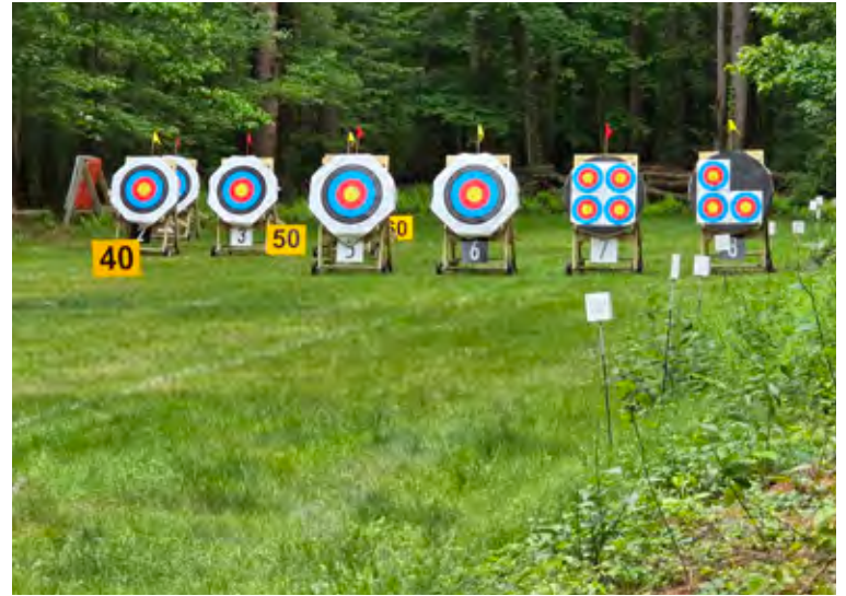
Wheeled Target Bale Stands