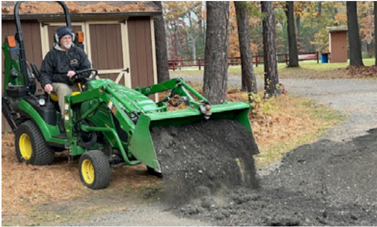
Ken B with Johnny D

Thank you to everyone who helped clear the stations and walkways on those snowy days when we were able to open. A few weeks ago during a severe wind storm the upper part of a pine tree fell at the end trap field, landing on the edge of the trap house. The roof and trim were damaged, and a branch went through the roof and broke part of a stack of targets in the carousel. Miraculously there was no damage to the machine, and we were able to repair the roof quickly.