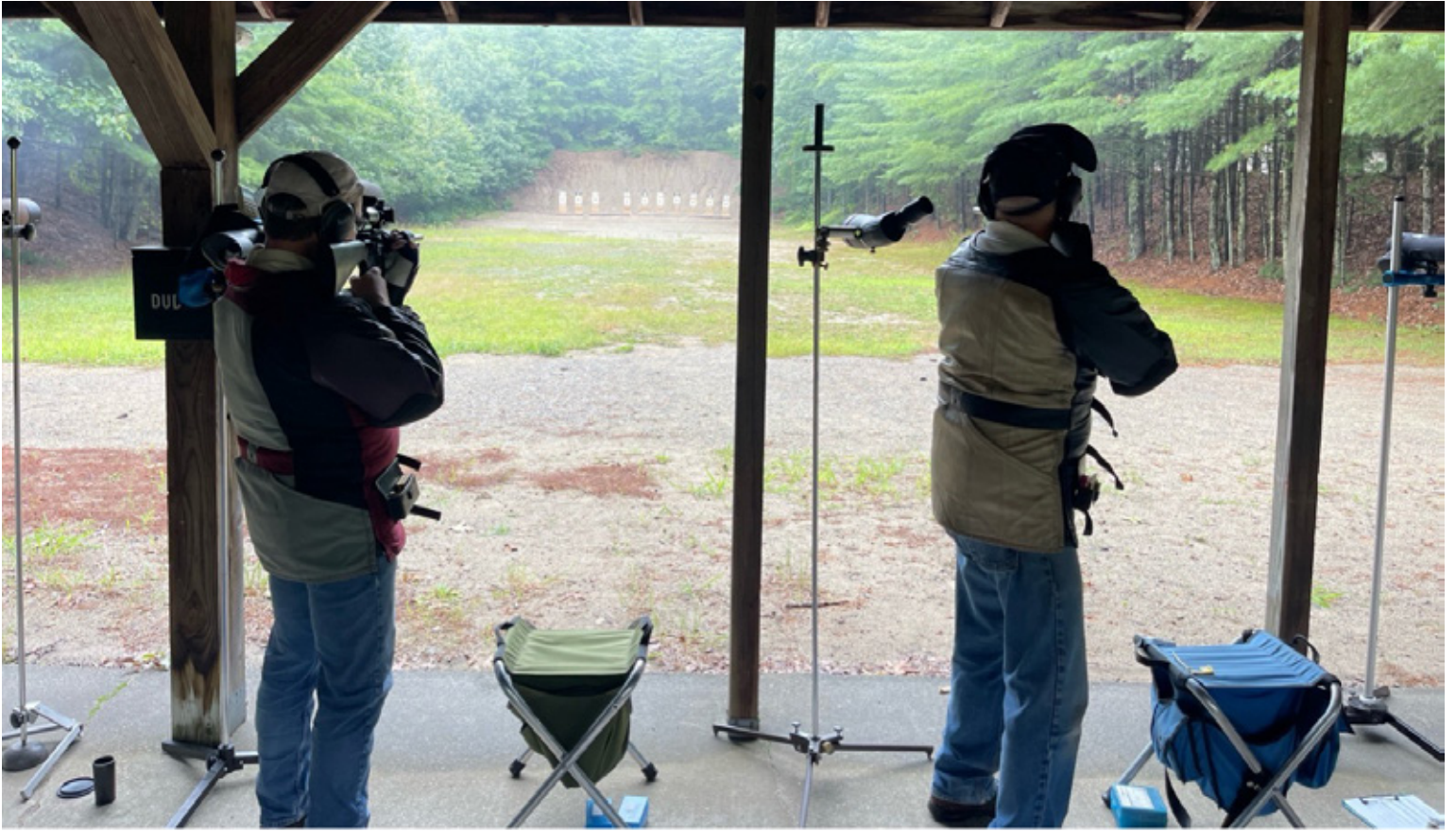
Riverside High Power Team in competition. Home matches this year are May 24th, July 12th and August 22nd