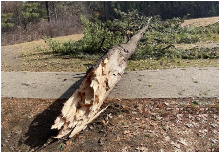
Fallen pine tree

Our tree guy was able to clean up the mess in short order.