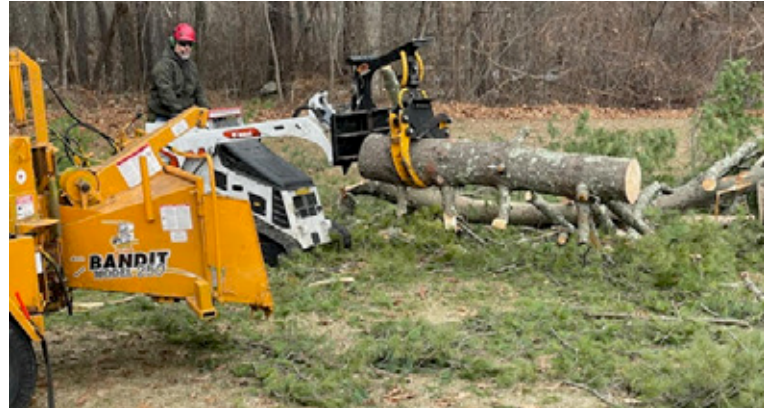
Juliano Cleaning up tree