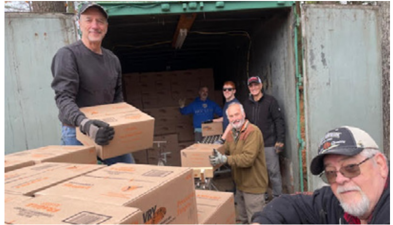
The gang moving targets