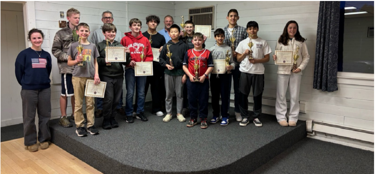
The Riverside Jr Rifle Program culminated with a awards banquet in the function hall.