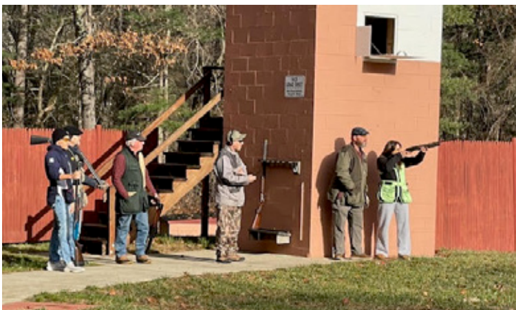
Sunday Skeet Shooting