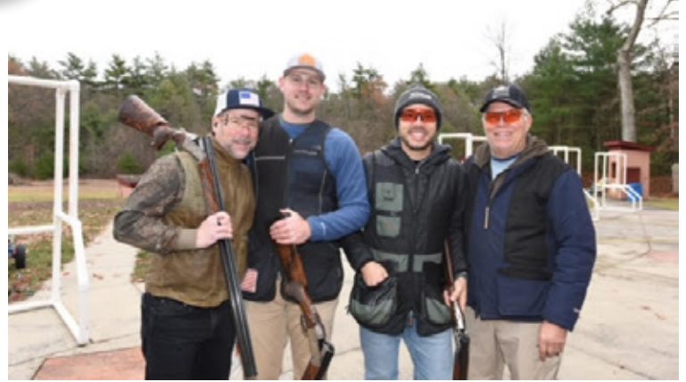
What a crowd